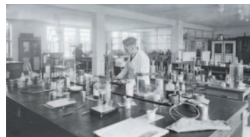
Pioneers at work developing the DENSO®-Tape.

For 100 years, the name DENSO (derived from the Latin word for “to seal”) has been synonymous with innovation. Even as early as 1927, the young company developed a special petrolatum tape designed to protect pipelines. In no time, this DENSO®-Tape became synonymous with passive corrosion prevention on pipelines. And from this point onwards, the DENSO brand has been known as a pioneer in the development and production of innovative sealing solutions.