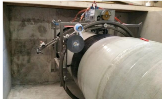
Machine processing of DENSOLEN®-AS50